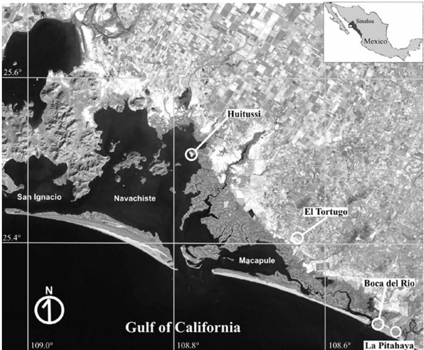
Fig. 1. Study area and location of the four fishery villages.

are municipal sewage from the main town in the area, Guasave (300,000 inhabitants); agricultural drainage, which transports fertilizers and biocides; and drainage from the shrimp farms, which includes organic nutrients, especially during the harvest, that flow into this system (Ruiz Luna and de la Lanza Espino 1999).