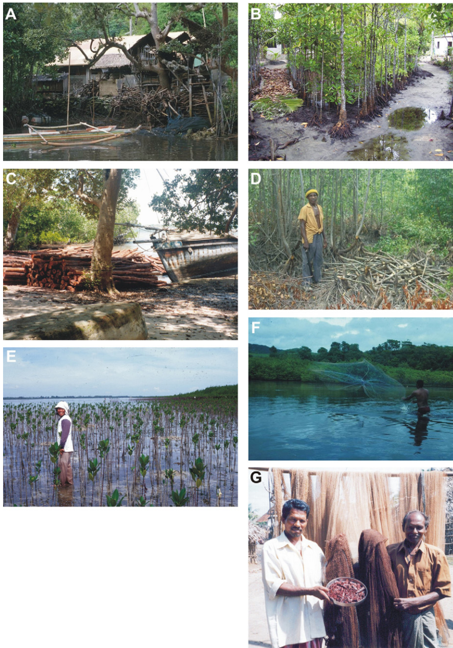
Fig. 1. (A) Fishermen in Bais Bay, Philippines commonly build their homes adjacent to mangroves where they gain ready access to wood products and favored fishing spots, and benefit from the storm protective value of mangrove trees. (B) An illustration of the concept of living in mangroves in Balapitiya, Sri Lanka: houses were built within a mangrove and Bruguiera gymnorhiza assemblages were cut in such a way that they form access paths to each house. (C) Mangrove poles at the Sita landing place in Mida Creek, Kenya waiting to be transported to markets and hardware stores. (D) Mangroves in Mankote, Saint Lucia are often cut to make charcoal, a fuel preferred by many West Indians for barbecuing. (E) Gleaners like this woman on Banacon Island, Philippines are free to harvest for shellfish within a plantation of Rhizophora stylosa as long as they do not disturb the young trees. (F) Simple fishing techniques like this throw-net are effective for capturing fish in the murky, brackish waters of the Mankote mangrove, Saint Lucia. (G) Fishermen holding a tray with pieces of Ceriops decandra bark used for dyeing fishing nets near Kakinada in Andhra Pradesh, India. They also show two freshly dyed nets and in the background previously dyed nets are hung to dry. Adopted from Dahdouh-Guebas (2006).

and wood fiber (to make rayon and paper); as sources of animal fodder, vegetable foods, and diverse traditional medicines and toxicants (see Bandaranayake, 1998, 2002 for a reviews); and as habitats for honey bees and hunted wildlife (see Table 1; Fig. 1G).